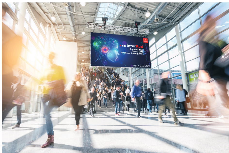
InterRed will present the latest version of InterRed ContentHub at Hannover Messe 2023.

In Hall 7 at Stand D09 on the „Automation & Digital Factory“ joint state stand of North Rhine-Westphalia, interested parties will have the opportunity to see InterRed live from April 17 to 21, 2023. The overall solution offers many more possibilities, which the InterRed experts will present live on site. Appointments can already be made in advance: www.interred.de/events